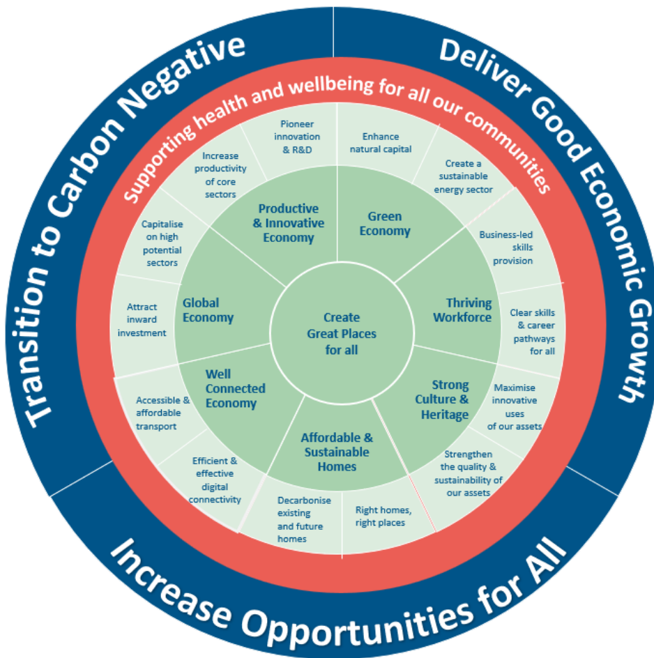
Figure 1: The Combined Authority's Economic Framework

15. To note, in response to the Mayor's pledges, an initial, high level overview of key priorities has been developed by the Combined Authority that builds on the economic framework. This is presented in a paper at the Combined Authority on 31 May and is shown below as Figure 2. The York pipeline will seek to reflect the priorities identified and others that emerge.